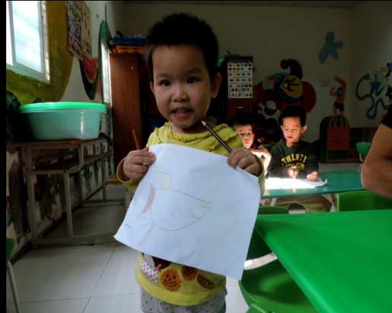
Kids learnt how to draw sharks