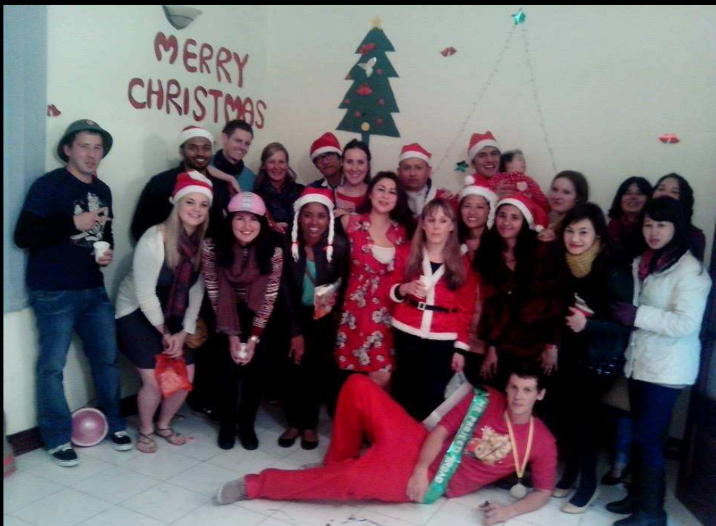
Projects Abroad Vietnam Christmas Party 2013

Follow us on Instagram for the inspiring and thought-provoking photos and stories: Projectsabroad_Vietnam :)