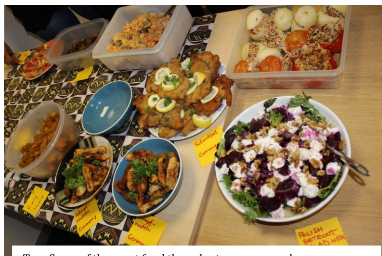
Top: Some of the great food the volunteers prepared.