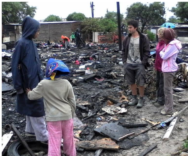
Our Building volunteers at the scene after the fire