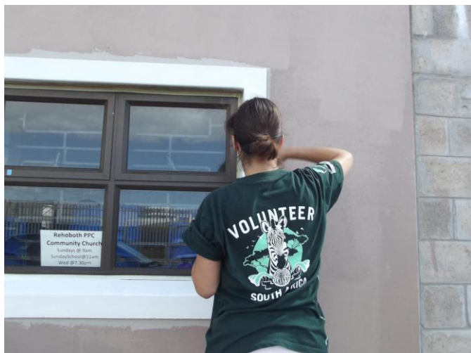
A volunteer painting the outside of Tehilah Educare.

The school needed a paint job which our volunteers, sponsored by Projects Abroad, were more than happy to do. We would like to say a big thank you to all the volunteers that came to participate on this day at this event.