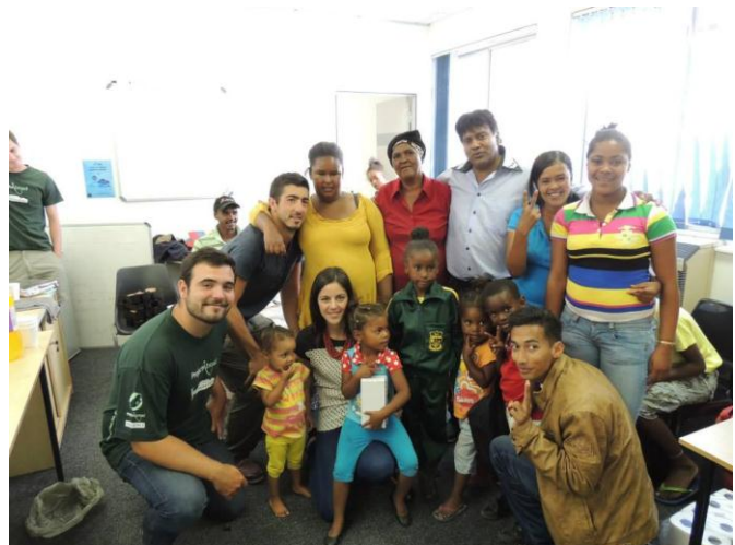
The family from Lavender with a group of our staff and volunteers