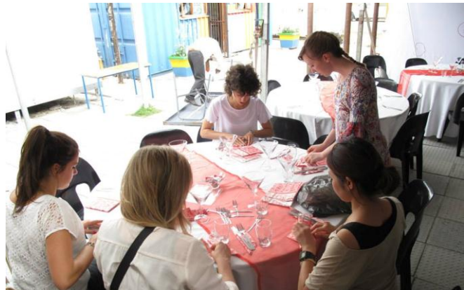
Volunteers set the tables for dinner.