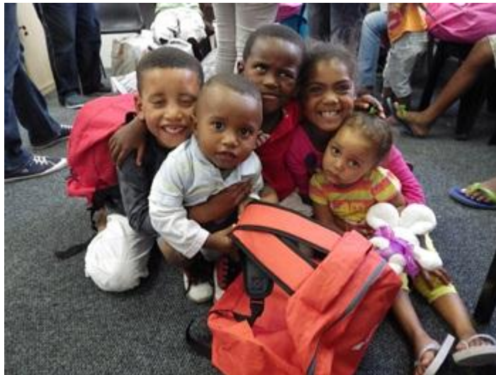
Children from the families who were affected by the fire