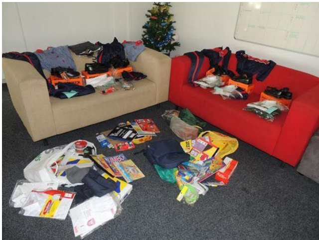
Some of the school uniforms, shoes and stationary donated.