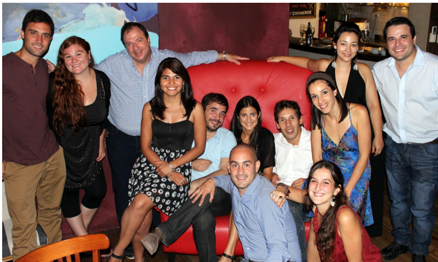
Projects Abroad Argentina Staff 2014